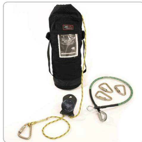
Available as part of complete kits for escape and rescue

DEUS Rescue delivers innovative professional rescue solutions worldwide. For more information, visit www.DEUSrescue.com .